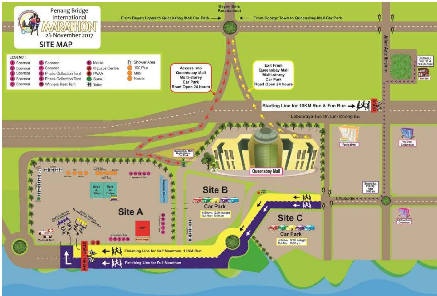
Figure 1 – Example of Site Map